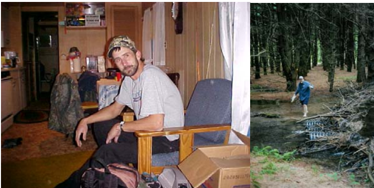
No Butt goofing off as usual

The landowner's private estate hands overseeing the upkeep of the various properties.