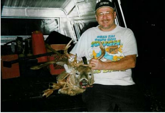
Herd control & re-location by Smoothie